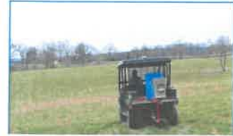
Figure 2. Frost seeding is accomplished by broadcasting clover seed onto closely grazed pastures in late winter or early spring. Using GPS guidance helps operators maintain equal spacing between passes and consistent speed.