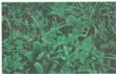
Figure 1. Clover and other legumes are an important part of sustainable grassland ecosystems. They form a symbiotic relationship with Rhizobium bacteria in which nitrogen from the air into a plant available form, improve nutritive value, and help to alleviate tall fescue toxicosis.