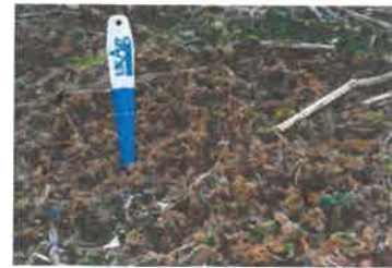
Figure 3. Freeze and thaw cycles during late winter result in the formation of cracks in the soil surface often referred to as a "honeycomb". This heaving incorporates clover seeds into the soil and is commonly referred to as "frost seeding".