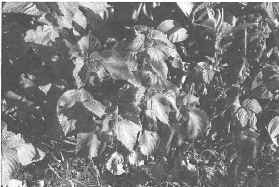
Perilla mint has a distinctive mint aroma, with opposite dark green to purplish leaves that have serrated leaf margins attached to square stems. Mature plants reach 2-3 feet tall and produce small, white to purple flowers with abundant seeds.

Perilla reaches 20 to 30 inches in height at maturity with opposite leaves. The white to whitish-purple flowers and subsequent seed which occur in late summer are attached to terminal spikes. The plant also has a distinct, minty odor, especially as it becomes more mature. The weed prefers shaded areas along